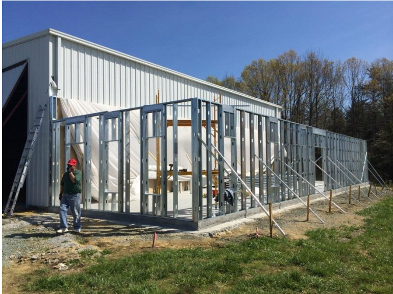
Jeremiah and Cindy (above) are up on the staging inspecting our work to ensure the framing is ready to receive their beautiful trusses.