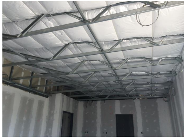
Windows, insulation, and drywall made a big difference!