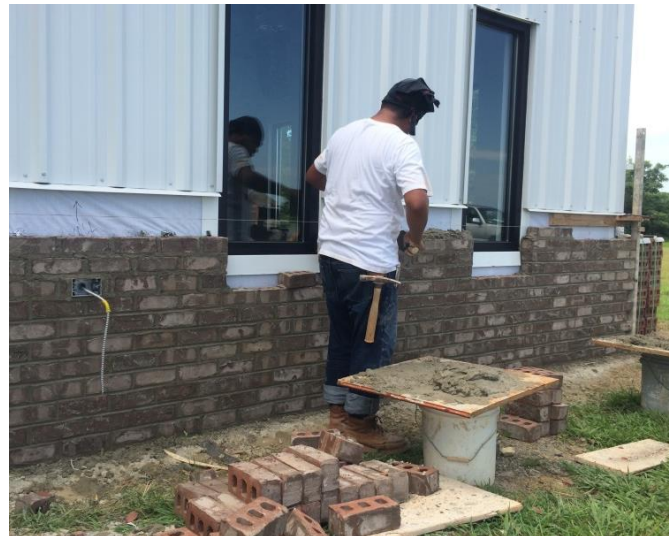
The exterior brick work began to take shape.