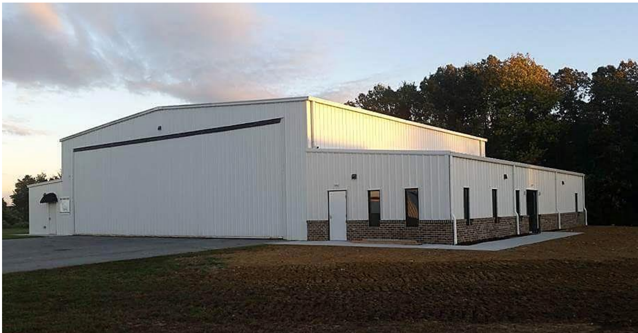
Missionary Air Group World Headquarters Burlington-Alamance Regional Airport