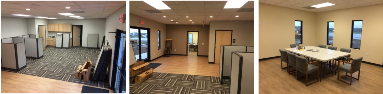
Time for the donated cubicle system and a little furniture.